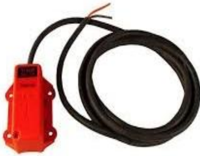
AMB HARD WIRED TRANSPONDER