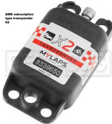
AMB subscription type transponder X2