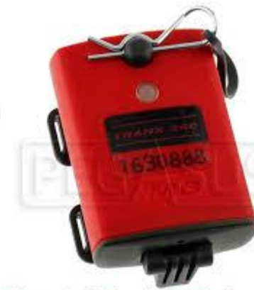
New style TranX 260 in bracket (transponder not included)

These are your three options with AMB Transponders. Track rentals will be the X260 with bracket. Use these pictures to help design your bracket to locate transponder.